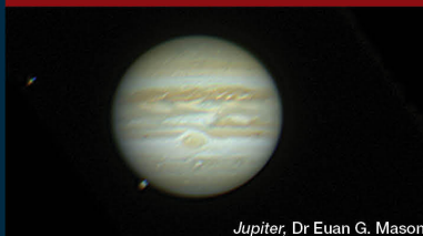
Jupiter