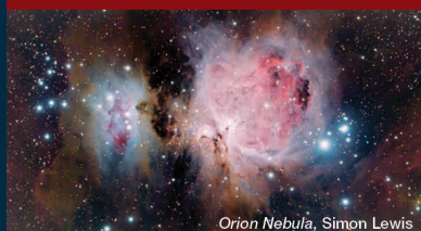
Orion Nebula

4 June–4 July West Melton Community and Recreation Centre